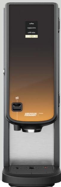
Bolero 21 with hot water tap