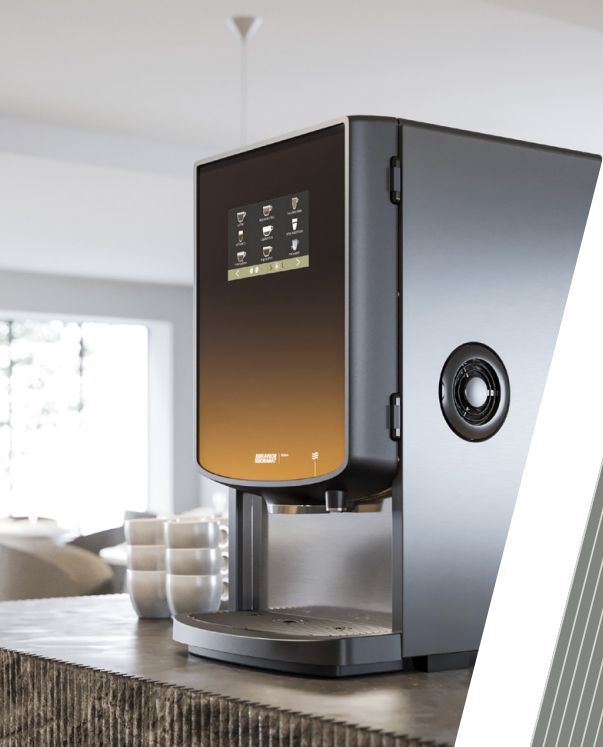
Bolero Turbo 403