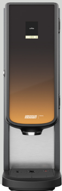
Bolero 11 without hot water tap